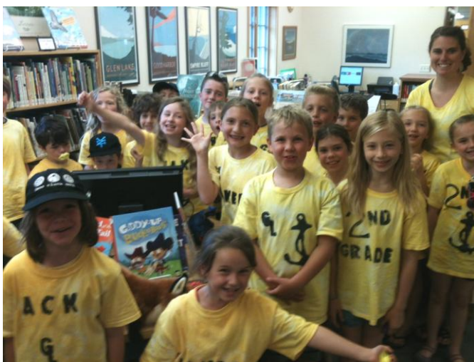
In May, the annual visit from Glen Lake second graders made for a fun morning.

Planning for library renovation and expansion took important steps forward. Another round of field trips to regional libraries provided practical tips and inspiring ideas. A thorough review of our strategic plan helped focus and prioritize building needs. Our new Building Committee developed a project timeline, with a goal of finalizing a building design by the end of 2017.