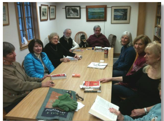
The Lakeshore Readers met every month for engaging discussions about great books.