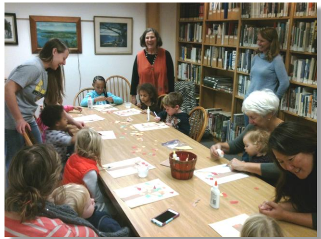
Stories & More for Preschoolers brightened the library every Thursday.

750 people, of all ages, attended events throughout the year, including story hours, movie screening, nature presentations, and author visits.